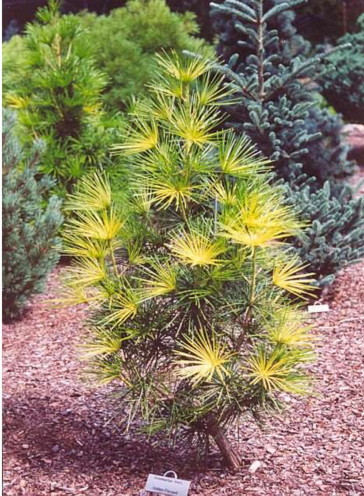
Sciadopitys verticillata 'Golden Parasol' Golden Parasol Japanese Umbrella Pine