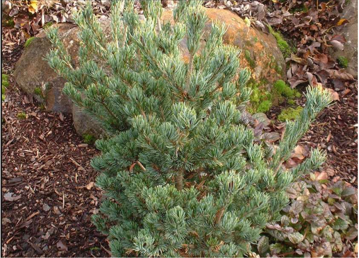
Pinus parviflora 'Arnold's Variegated' Arnold's Variegated Japanese White Pine