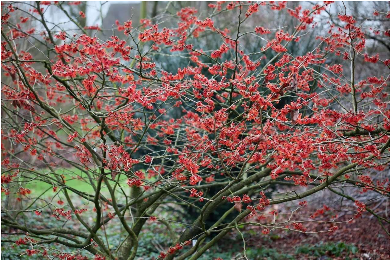
Hamamelis intermedia 'Birgit'